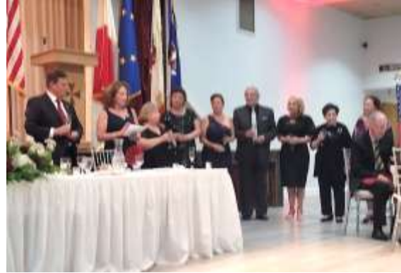
The Planning Committee

The MHA supports and participates, along with other Bay Area Maltese organizations, on the Malta Day Planning Committee.