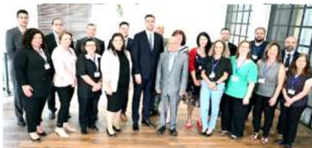
Deputy Prime Minister Ian Borg with members of the Council of Maltese Living Abroad