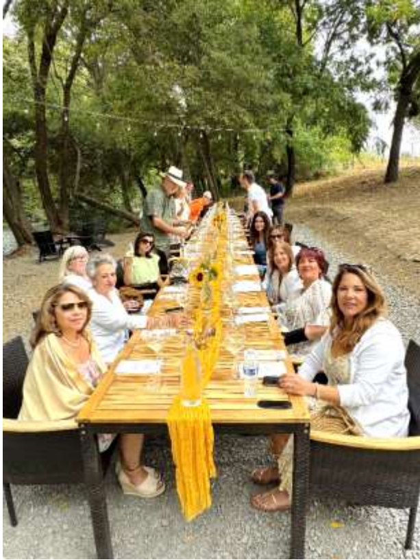
Asthete Winery Group Table