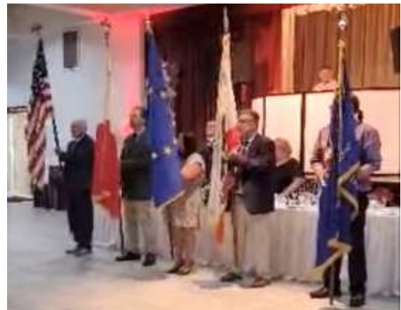
The color guard

The committee presents the Maltese community with a beautiful and thoughtfully organized annual Malta Day Gala dinner event in September. This year's event was another successful evening enjoyed by all attendees.