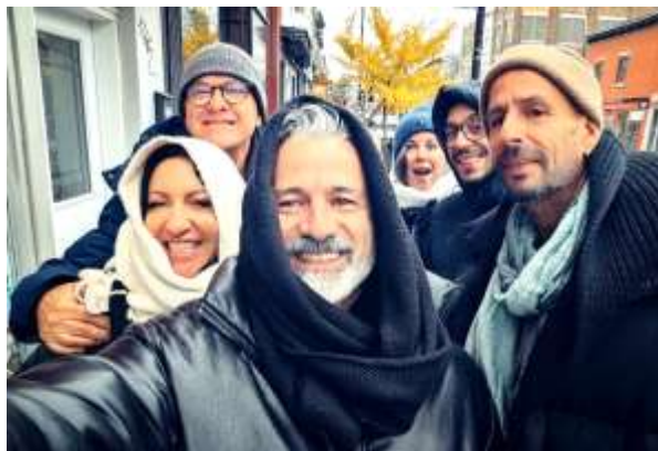
On a street in Toronto

• 7 November 19:30 – St. Paul the Apostle Church Hall, Toronto, ON