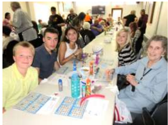
My grandbabies with my mom