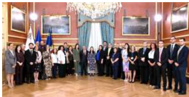
Her Excellency Myriam Spiteri Debono with members of the Council of Maltese Living Abroad and Ministry