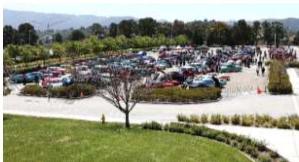
Lot overview of 2025 car show

Our events include holding an annual Classic Car Show event in May where more than 100 classic cars are displayed.