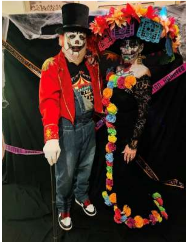
“Day of the Dead”, 1 st prize winners