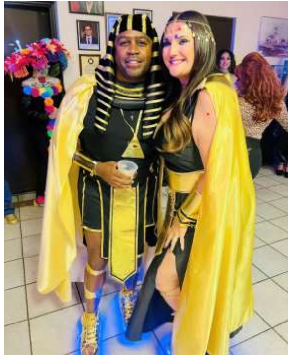
“Egyptian god and goddess,” 2 nd prize winners

Congratulations to our first, second and third prize costume contest winners!!!