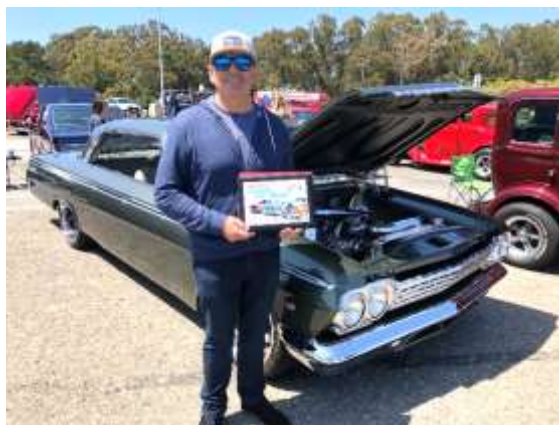
Best in Show

A Maltese food truck, For the Love of Malta, offers pastizzi and several other Maltese culinary delights to anxiously awaiting customers.