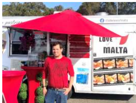
For the Love of Malta Truck

A Maltese food truck, For the Love of Malta, offers pastizzi and several other Maltese culinary delights to anxiously awaiting customers.